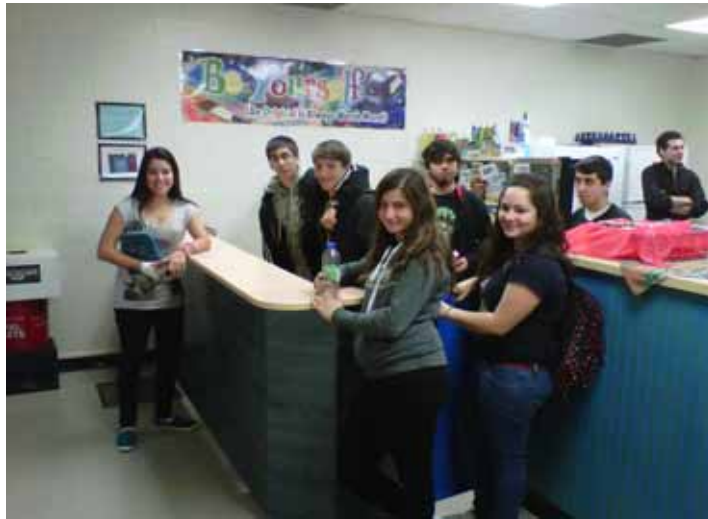
WOTP students working along side with Learners Without Borders Volunteers at The Corner Store of LLHS, an in-house work-study program

The WOTP program is very involved with various charitable causes, mainly the Learners Without Borders organization; a charitable organization that originated at LLHS, volunteer work at Sun Youth of Montreal and others. Students are taught that responsible and successful members of the community are also contributing members of society.