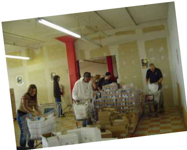
Volunteer work at Sun Youth, Montreal