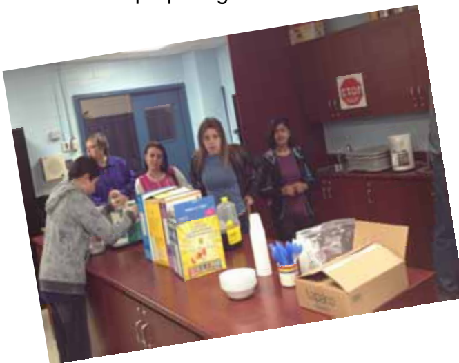
WOTP Students preparing breakfast & lunch

Helping students learn life skills is a very integral part of the WOTP program. The Social & Study Centre also contains a fully functional kitchen. The WOTP program is fortunate to be sponsored by “The Generations Foundation” which provides the program with an extensive supply of food. Students are then taught to organize, prepare and cook food for breakfast and/or lunch on a regular basis. Students work as a team in the preparation, set-up and clean-up process.