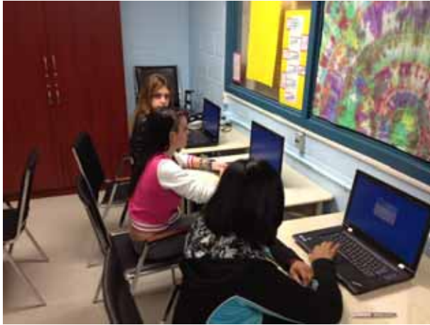
WOTP teachers working on assignments in The WOTP Social & Study Centre

The academic classrooms and the WOTP Social & Study Centre are currently equipped with 5 computers, 6 new laptops and 3 ipads loaded with many educational apps to further assist students.