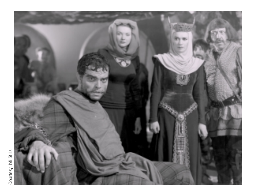
Contrasting interpretations of the same play: Orson Welles in Macbeth (Orson Welles 1948) and Toshiro Mifune in Throne of Blood (Akira Kurosawa 1957)