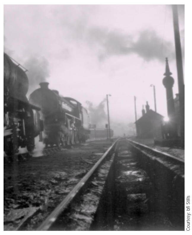
British Transport films of the 1950s promoted the power and beauty of the railways. This is York (J.B.Holmes, 1953) in the video compilation This Sceptred Isle – Yorkshire (British Transport Films 1952-62) available from bfi Video.

▶ Enrichment initiatives for pupils: out of school hours funding can be used to offer pupils more extended and intensive opportunities for watching or making moving image texts, through video or film clubs, video production groups, and cinema visits. See also Chapter 7 for resources and screening providers.