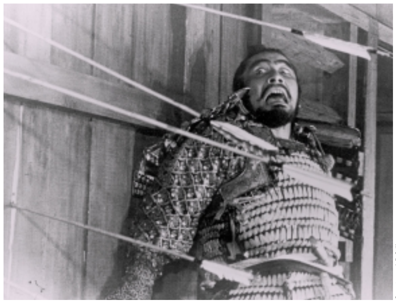
ourtesy: bfi Still