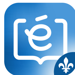
Clic école icon

Once installed, the Clic école icon will appear on your device's home screen.